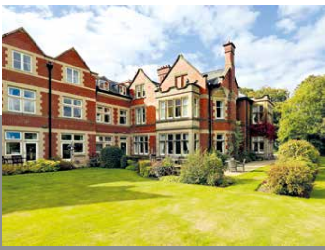
Corbrook Park Nursing Home, Audlem, Cheshire. Extended and refurbished