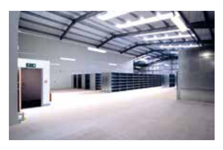
The £850K expansion of Torus Measurement Systems