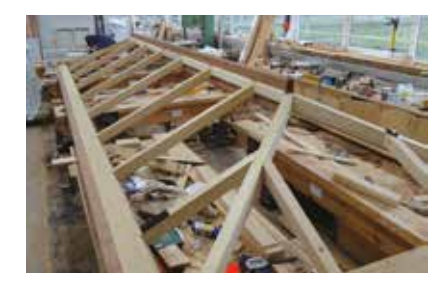
A roof lantern light under construction