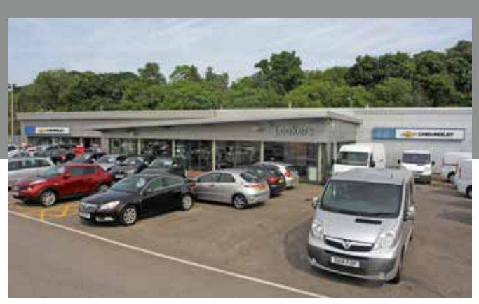
Lookers, Renault/Nissan, Chester