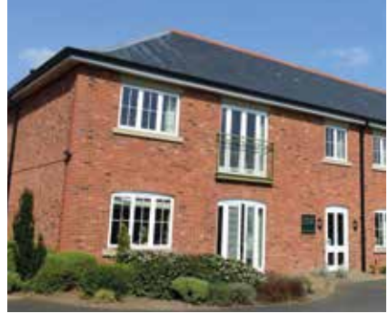
Cedar Court created to provide bespoke dementia care for 35 residents at Corbrook Nursing Home, Audlem

We offer fully flexible, tailor-made 'design and build' construction packages whether it's a new house or large industrial high performance system. We take into account the client's specific design and material requirements, from initial brief to finished product.