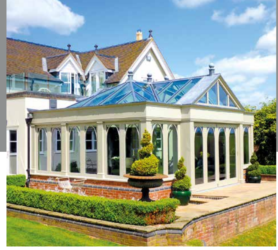
A bespoke orangery designed and built using Accoya wood for stability and longevity