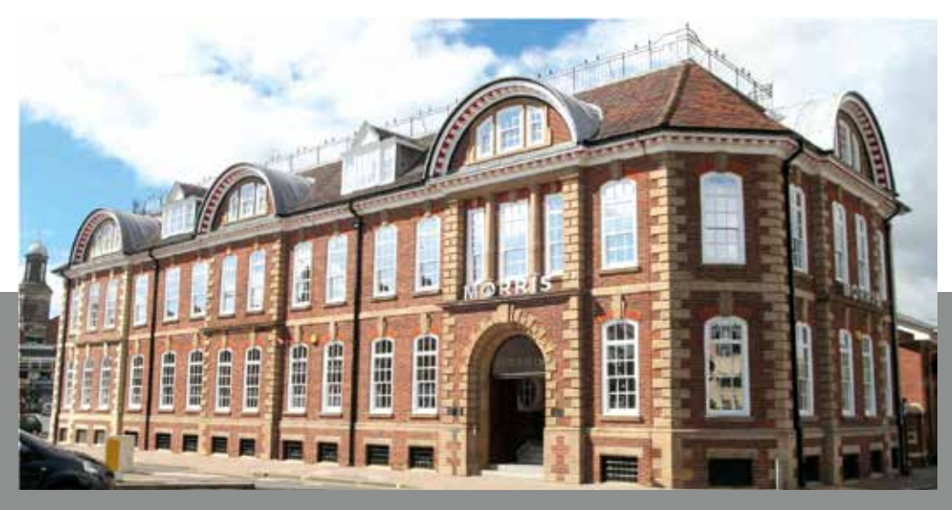
Welsh Bridge Head Office today

Where it all began in Frankwell, Shrewsbury