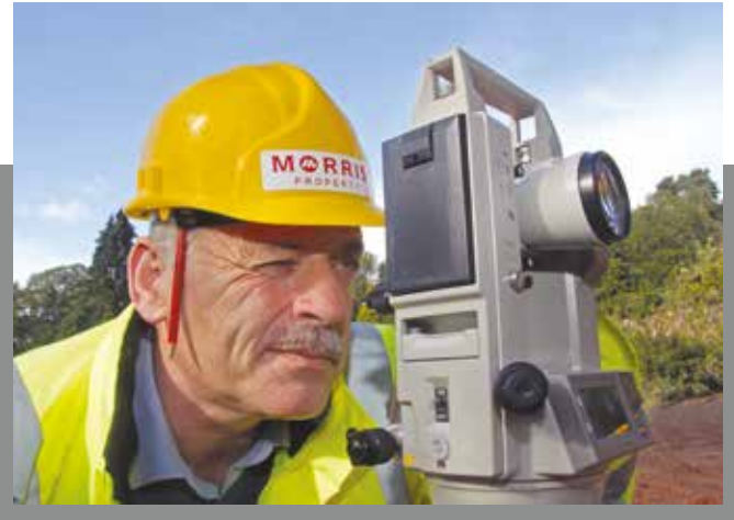
Morris Site Teams include Site Managers, Assistant Site Managers, Engineers, Crane Operators and other skilled operators supplemented by trusted tradesmen

Offering a complete construction service, our skill base covers all disciplines within the industry including project management, surveying, estimating and purchasing, working with specialist advisors.