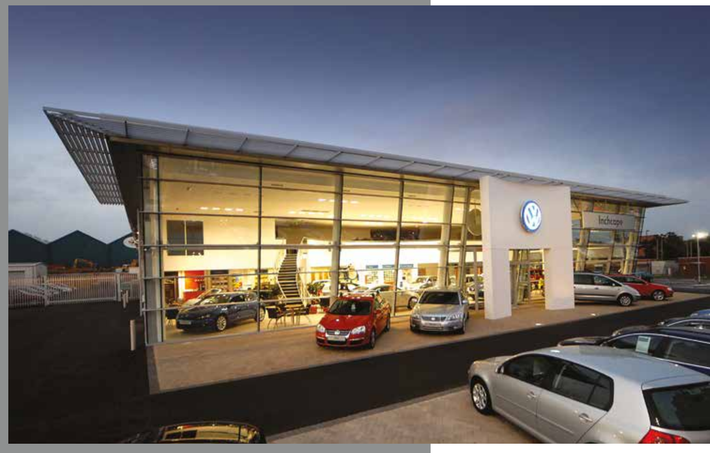
VW Showroom, Vanguard Way, Shrewsbury