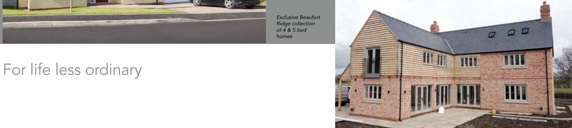
New country style dwelling, Malpas, Cheshire