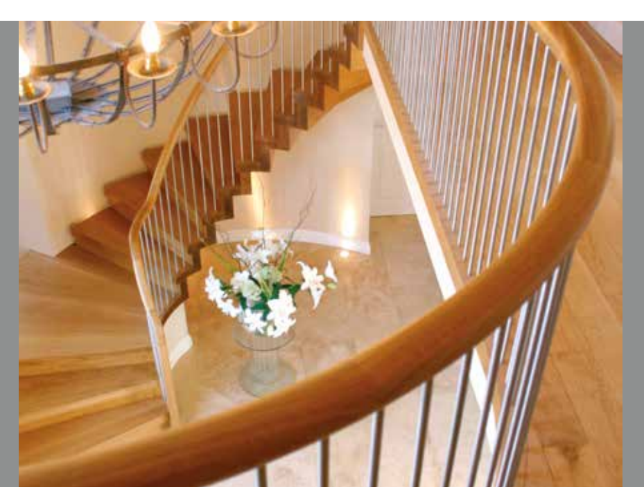
Cantilevered, English Oak contemporary curved staircase