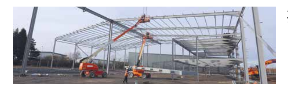
Hortonwood West, Telford under construction. A £3.95M project for Telford & Wrekin